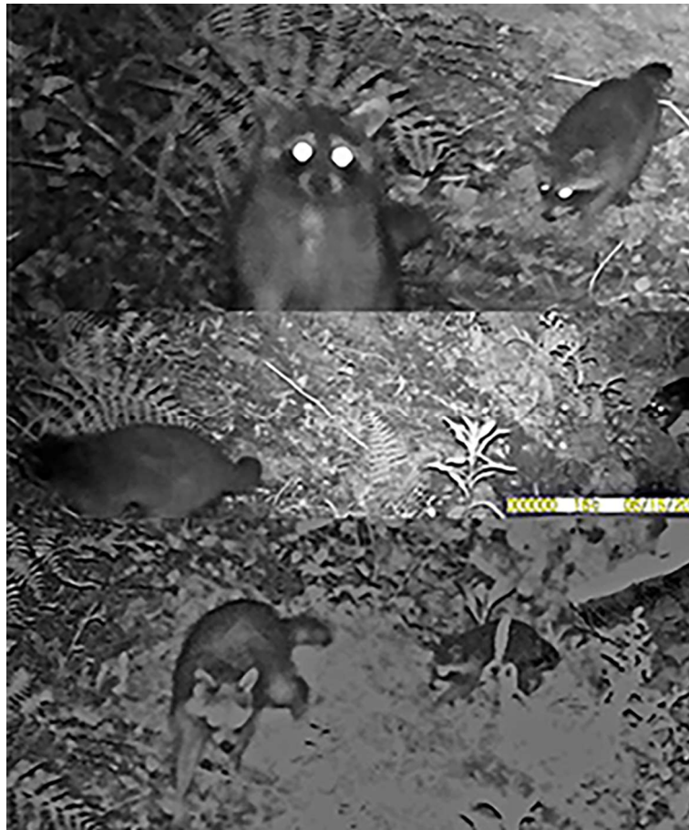
Fig. S3. Raccoon female with cub.